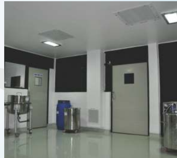
MANUFACTURING AREA "CLEAN ROOM CLASS 1000"